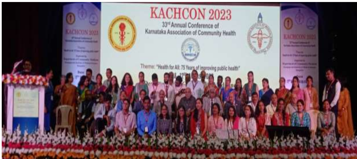
Organising Team of Kempegowda Institute of Medical Sciences (KIMS), Bangalore