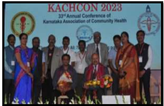
The Organizing Team being felicitated by the KACH office bearers