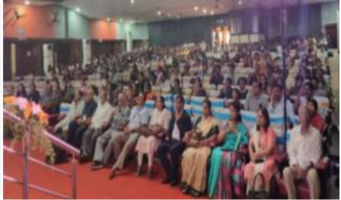
Delegates, speakers and invited guests at KACHCON 2023