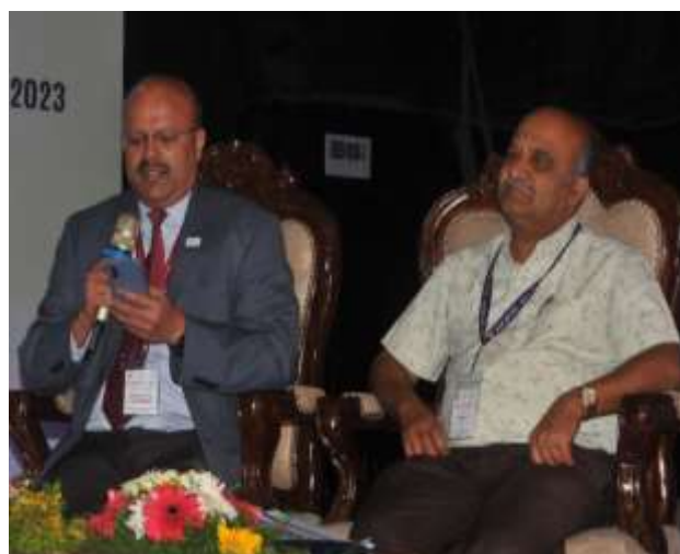
Chairpersons for the session providing their expert comments