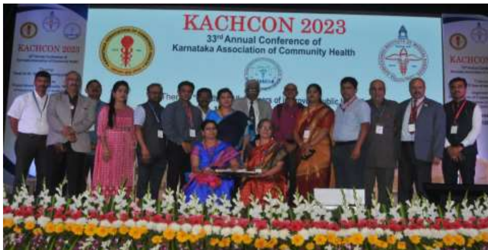
Felicitating the organising team in appreciation for their organised team effort.