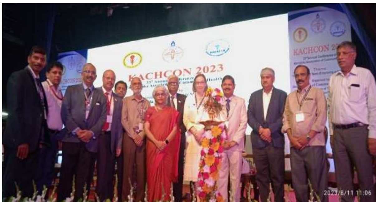
Inauguration of the conference by lighting of lamp by the chief guest and guests of honour