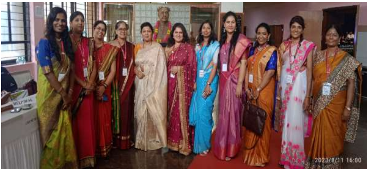
Reception and registration committee members of KACHCON 2023

The registration for the conference was done from 8.00 - 9.00 AM for delegates, speakers and invited guests. All the delegates were received and welcomed to KACHCON 2023