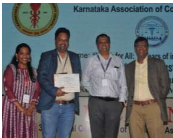
Chairpersons distributing certificates to the speakers

The Plenary session on Anaemia Mukht Bharat: Combating Iron Deficiency anaemia for a Healthy nation with a focus on improving public health for all with the broader goal of “Health for All: 75 years of improving Public Health”.