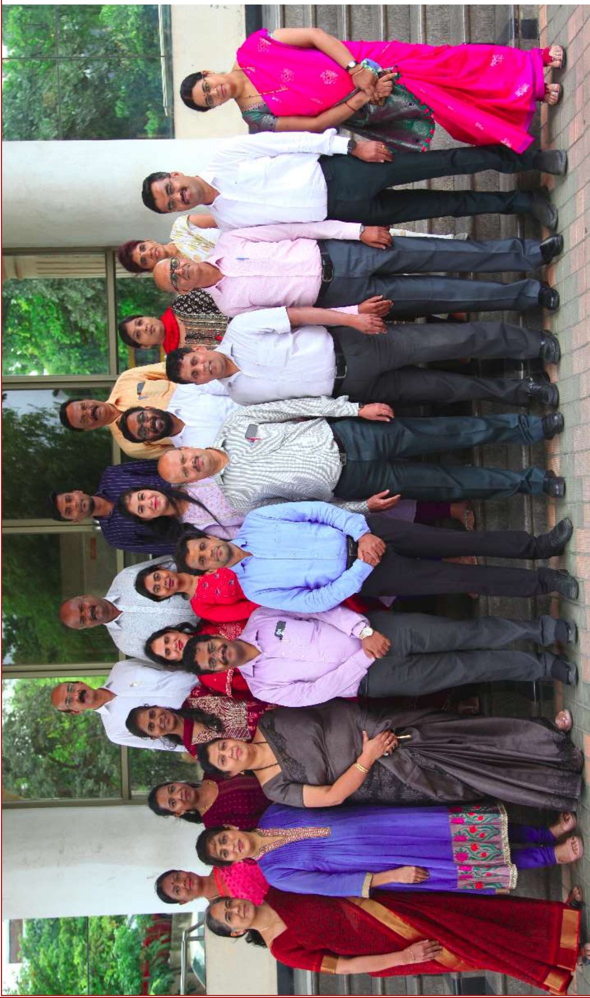
Organizing Committee, Department of Community Medicine, KIMS, Bengaluru